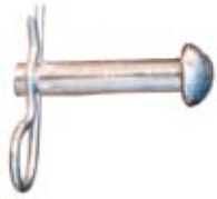
Rivet and Hitch Pin .077 lbs